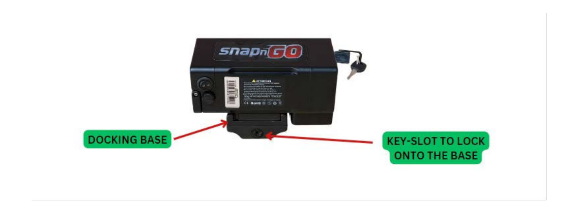
Step 2: Insert the plug from the battery docking base into the 36v DC socket on the inverter.

Step 1: Carefully take SNAPnGo battery from Glion off the Glion SNAPnGO Electric Scooter and install it onto the battery docking base provided with the inverter. Lock the battery onto the docking base using the provided key.